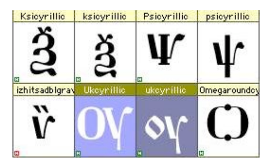
Fig. 5: Uppercase-only and lowercase-only implementation

It could be argued that as long as the solution is not clear, it is better to have the uppercase-only variant in [0478], because word-processors usually have a function to capitalize words written in lowercase letters and vice versa. But a lowercase word-form like δγΓο ДΗΤΗ would look like ΟγΓΟ ДΗΤΗ after applying this function if we were to have the mixed uppercase-lowercase variant in [0478] – not to everyone's typographical taste, one would assume.