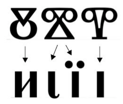
Fig. 18: Transliteration of Glagolitic 'i'

If we take, for example, the Glagolitic i, we'll see that there is certain problem here. The Glagolica has three different forms for the i (see Fig. 18), and these three characters – all encoded in Unicode 4.1 – are usually transliterated with the four Cyrillic characters in the second row.