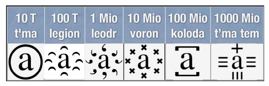
Fig. 17: Old Russian number signs according to Vostokov

From the six signs, only two are encoded in the Cyrillic block ( legion and leodr ), and the first one, a combining circle, could possibly be identified with slot no. [20DD], block "combining diacritical marks for symbols", but that doesn't appear to be the ideal solution.